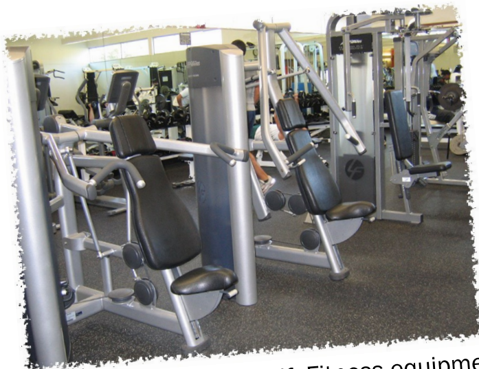
Fitness center featuring LifeFitness equipment

Membership includes unlimited use of cardio and weight room equipment, basketball gymnasium, and group exercise classes.